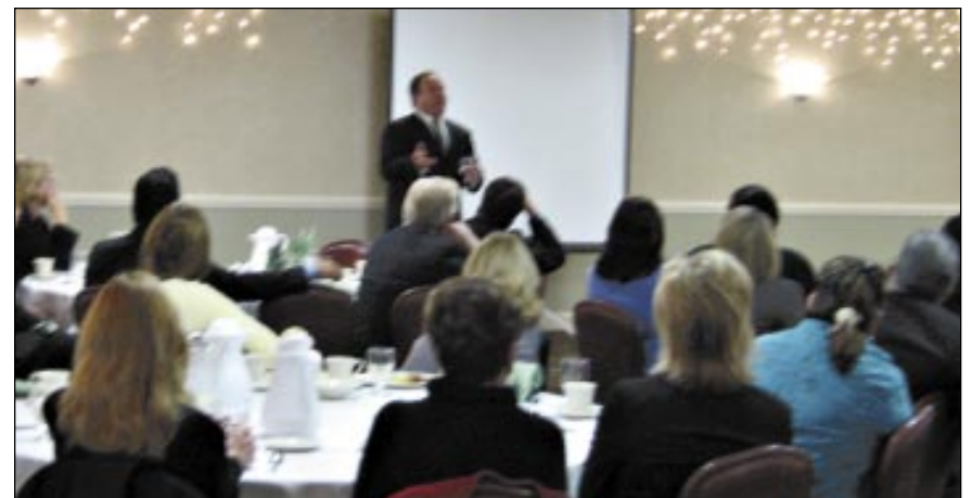
A full house of SCAOR members packed the Seaciff Inn to meet with DRE Commissioner Jeff Davi